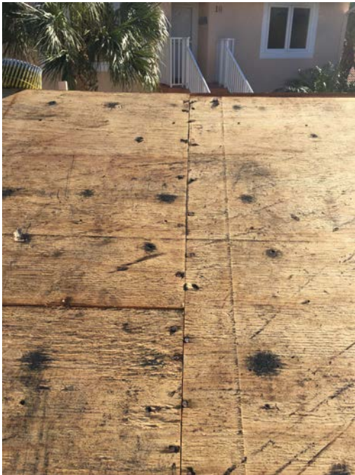
Plywood Sheathing, 8D Nail, 6" Spacing