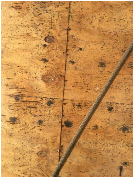
Plywood Sheathing, 8D Nail, 6" Spacing