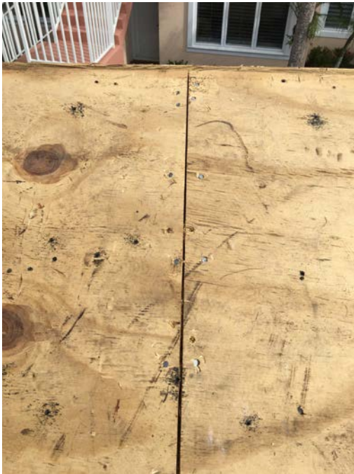
Plywood Sheathing, 8D Nail, 6" Spacing