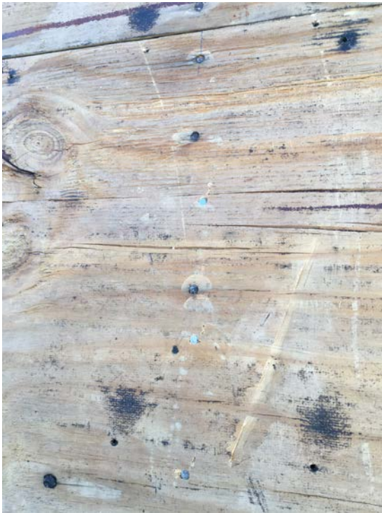
Plywood Sheathing, 8D Nail, 6" Spacing