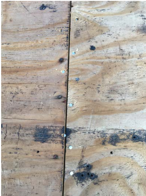
Plywood Sheathing, 8D Nail, 6" Spacing