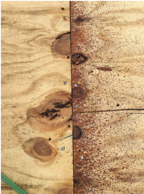
Plywood Sheathing, 8D Nail, 6" Spacing